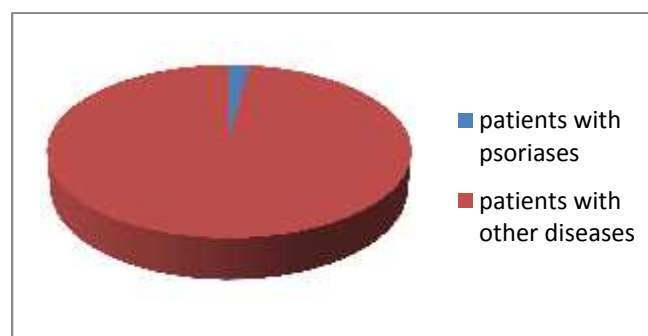
Figure (1): Incidence of psoriasis in patients attending dermatological consulting clinic in Baquba teaching hospital.

The study showed that out of ten thousands, nine hundred and sixty four patients with different skin diseases who attended the outpatient clinic of department of dermatology in Baquba Teaching Hospital, 220 (2%) patients had psoriasis, over a period of one year as shown in figure [1].